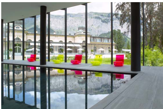
delight & spa beauty

While children exercise how to build a raft, swing the club on the new Buna Vista Golf Sagogn golf course and try their hand at being a pizza cook at Ristorante Pomodoro, the parents can dive into a unique feel-good world in the delight spa & beauty and leave everyday life behind them. The wellness oasis covering more than 2500 square meters leaves nothing to be desired regarding relaxation, rest and well-being. From a Caribbean St. Barth freshness face and décolleté massage for mom to a Haki or LaSiala shoulder and neck massage for dad – at the Waldhaus Flims Mountain Resort & Spa pleasurable relaxation turns into an experience.